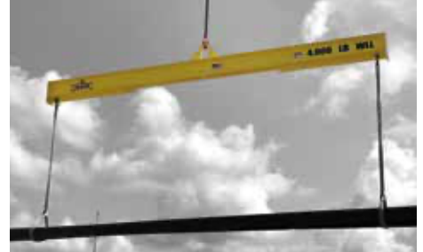
LIFTING BEAM - LOW HEADROOM ADJUSTABLE