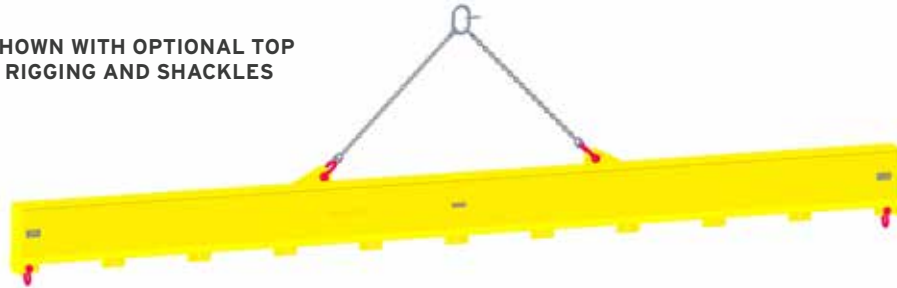
SHOWN WITH OPTIONAL TOP RIGGING AND SHACKLES

* Sold without shackles, hooks or top rigging