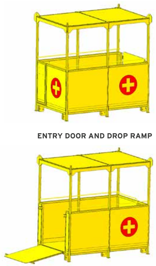
ENTRY DOOR AND DROP RAMP